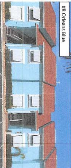
#8 Orleans Blue