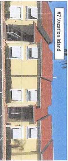
#7 Vacation Island