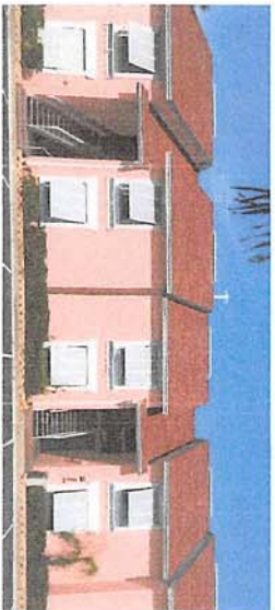
#5 Don Cesar